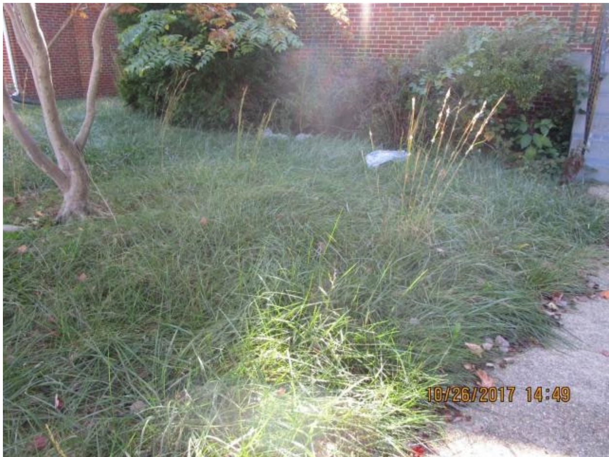
Temple Hills, MD – Overgrown grass