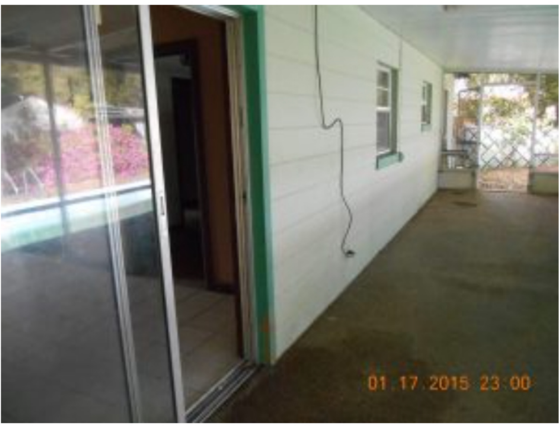
Unsecured screen door at a Deutsche Bank-owned property in Orlando, FL