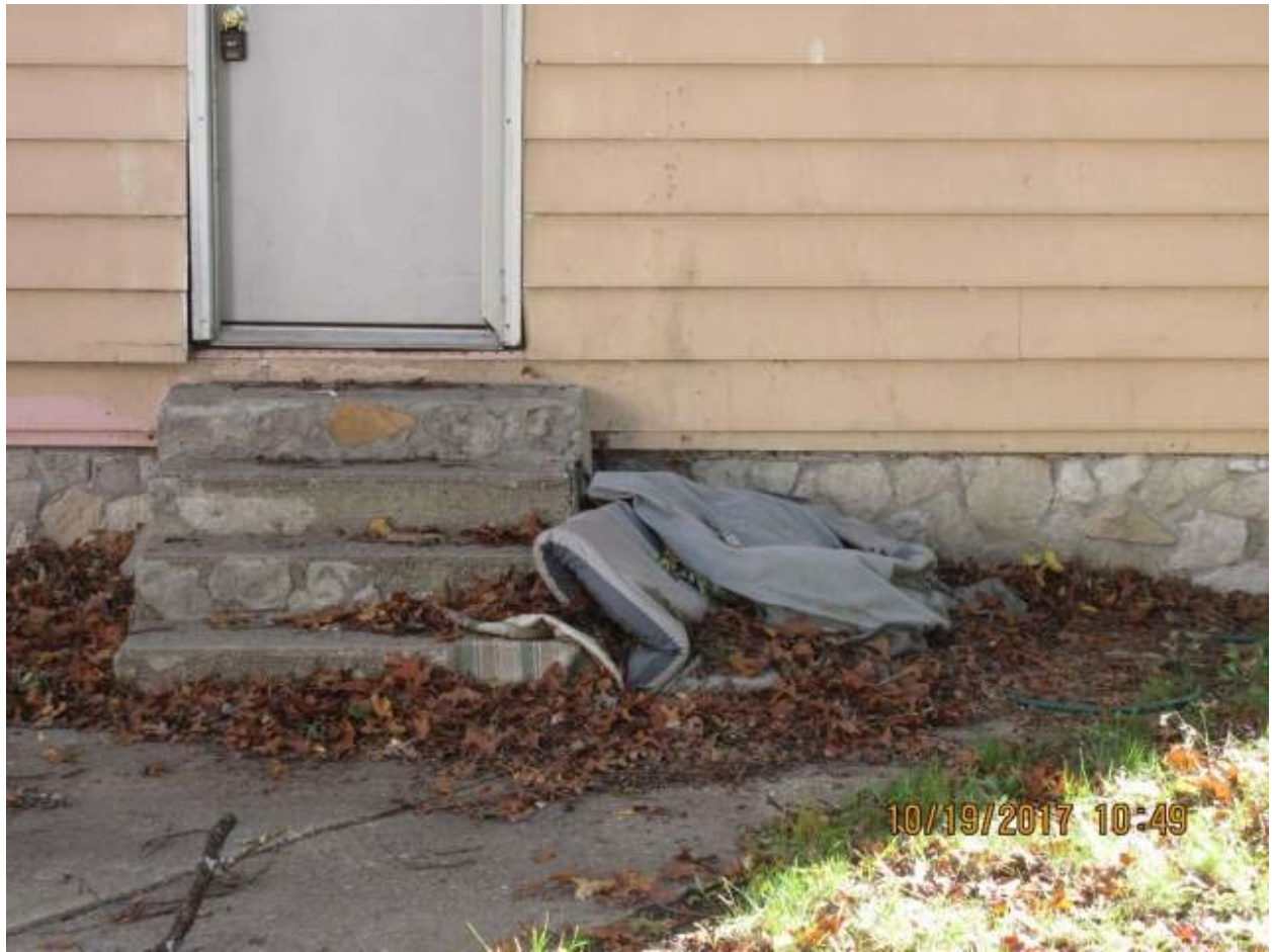
Muskegon Heights, MI – Trash and leaves