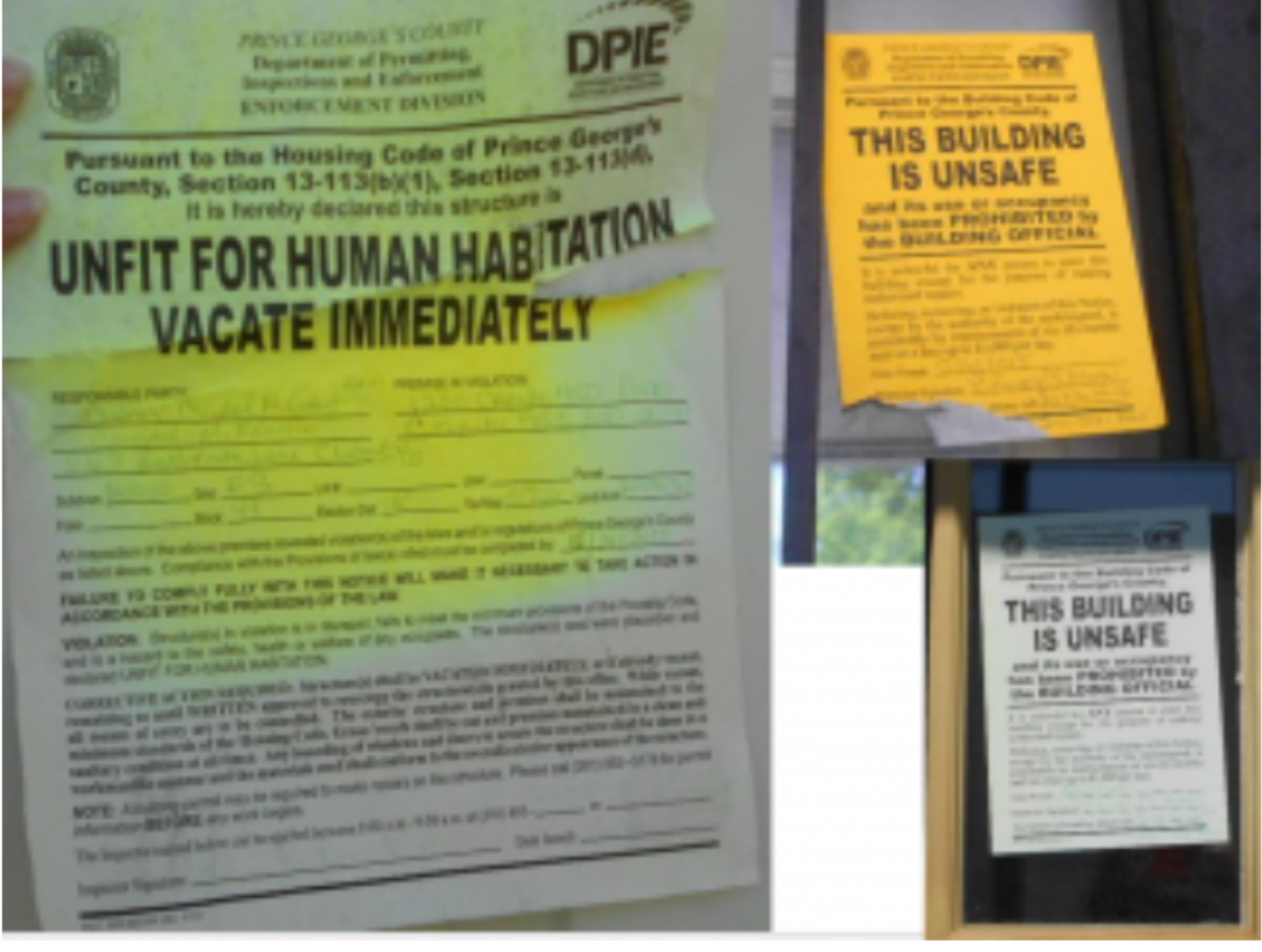
These signs are from a Deutsche Bank-owned house in Prince George's County, MD.