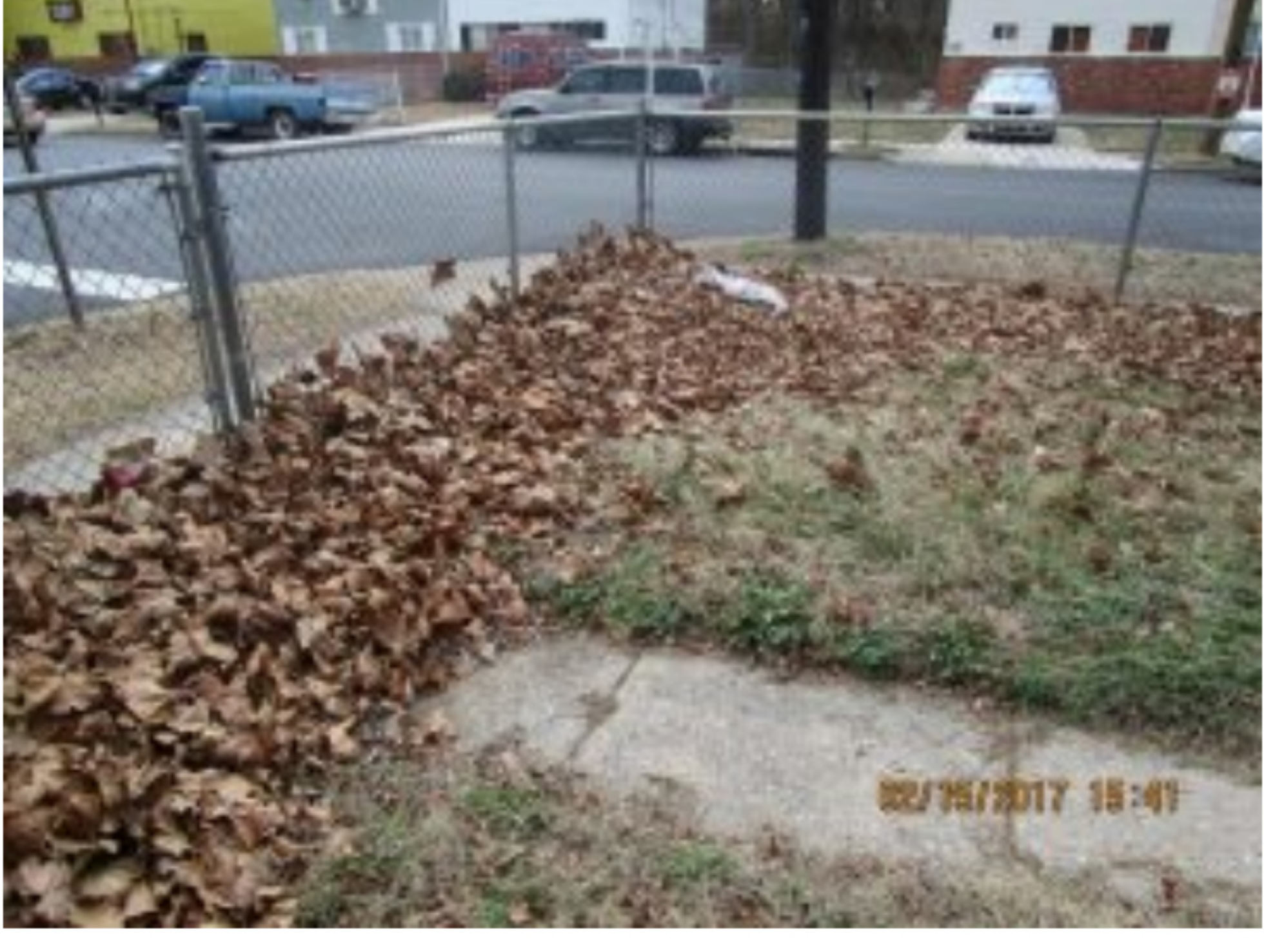
Unraked leaves in Prince George's County