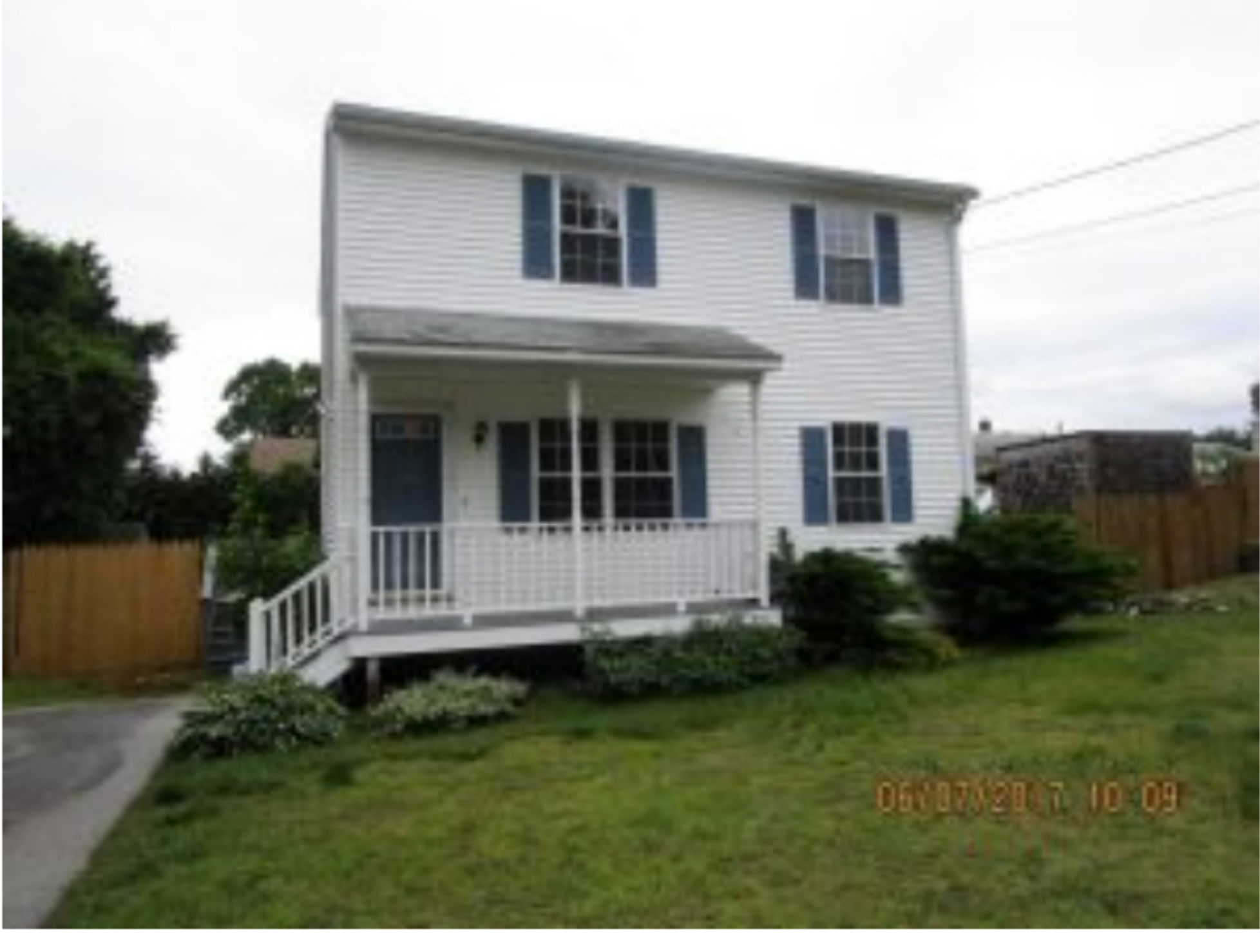
Meanwhile, Deutsche Bank properties in White neighborhoods, like this one, were well-maintained.