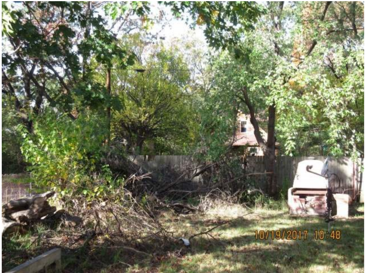
Muskegon Heights, MI – Dead shrubbery