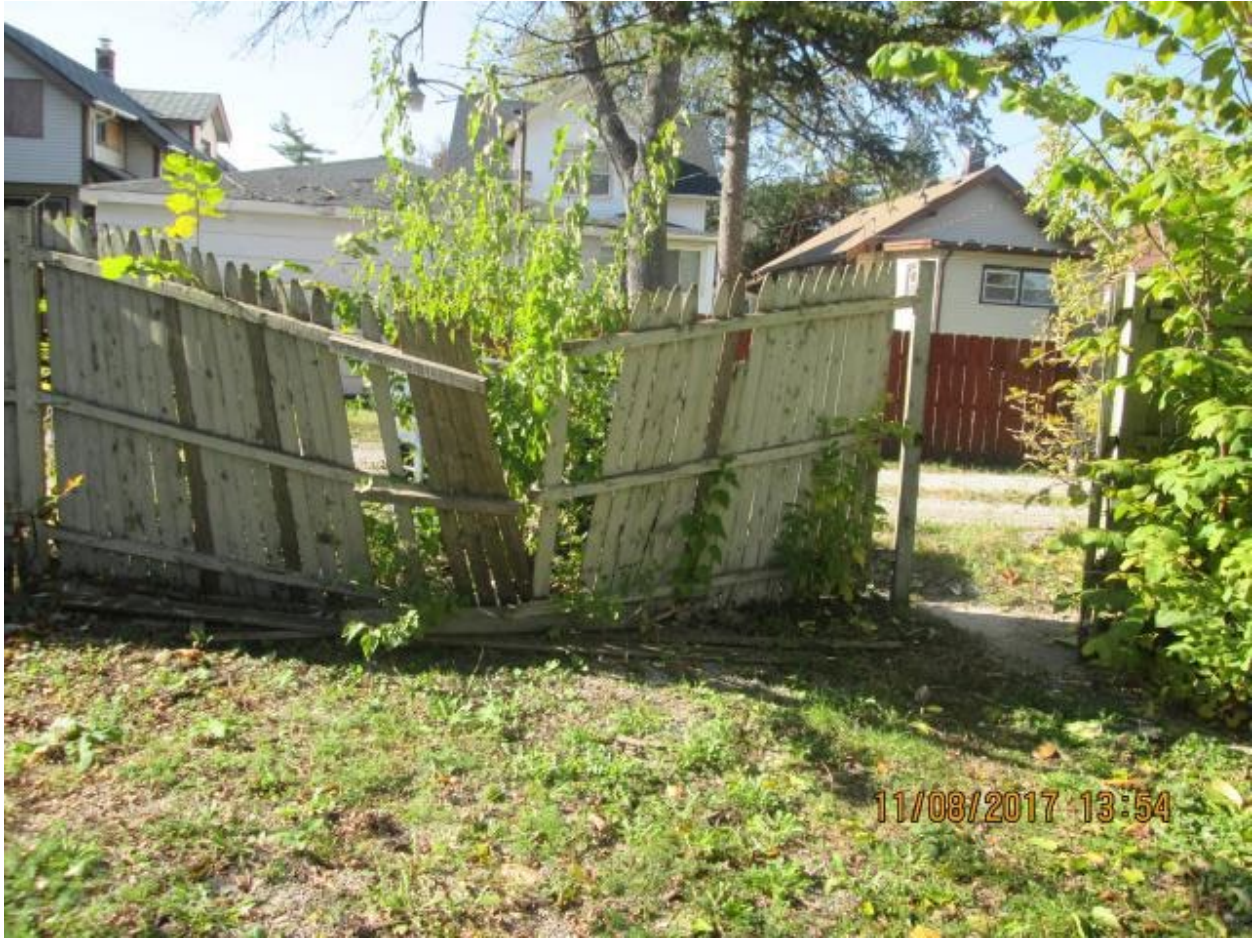
Maywood, IL – Overgrown shrub and damaged fence