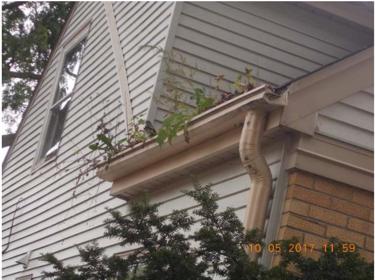
Milwaukee, WI – Obstructed gutters