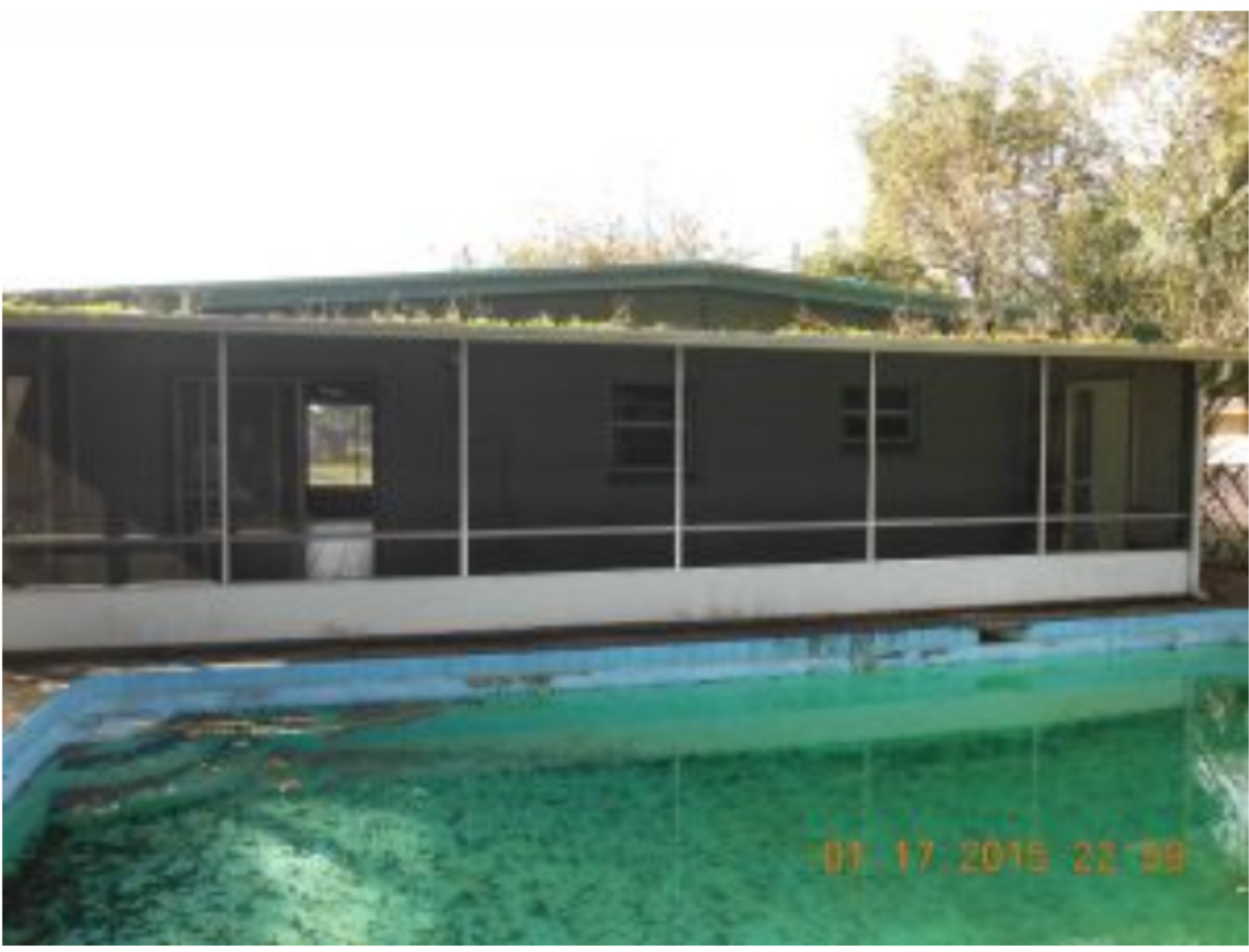
Unsecured, dirty pool and obstructed gutters at a Deutsche Bank property in Orlando