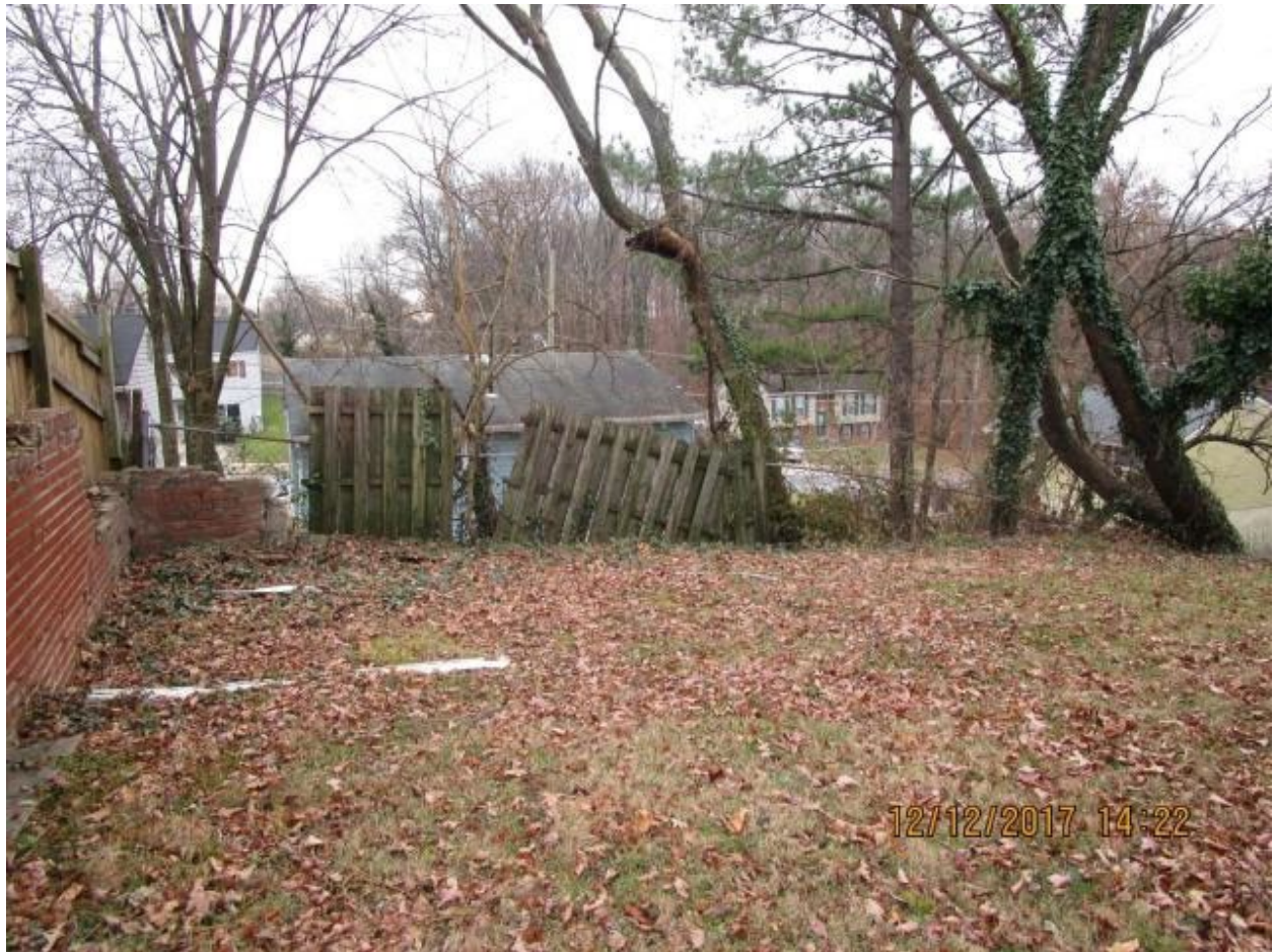
Capitol Heights, MD – Dead leaves and damaged fence