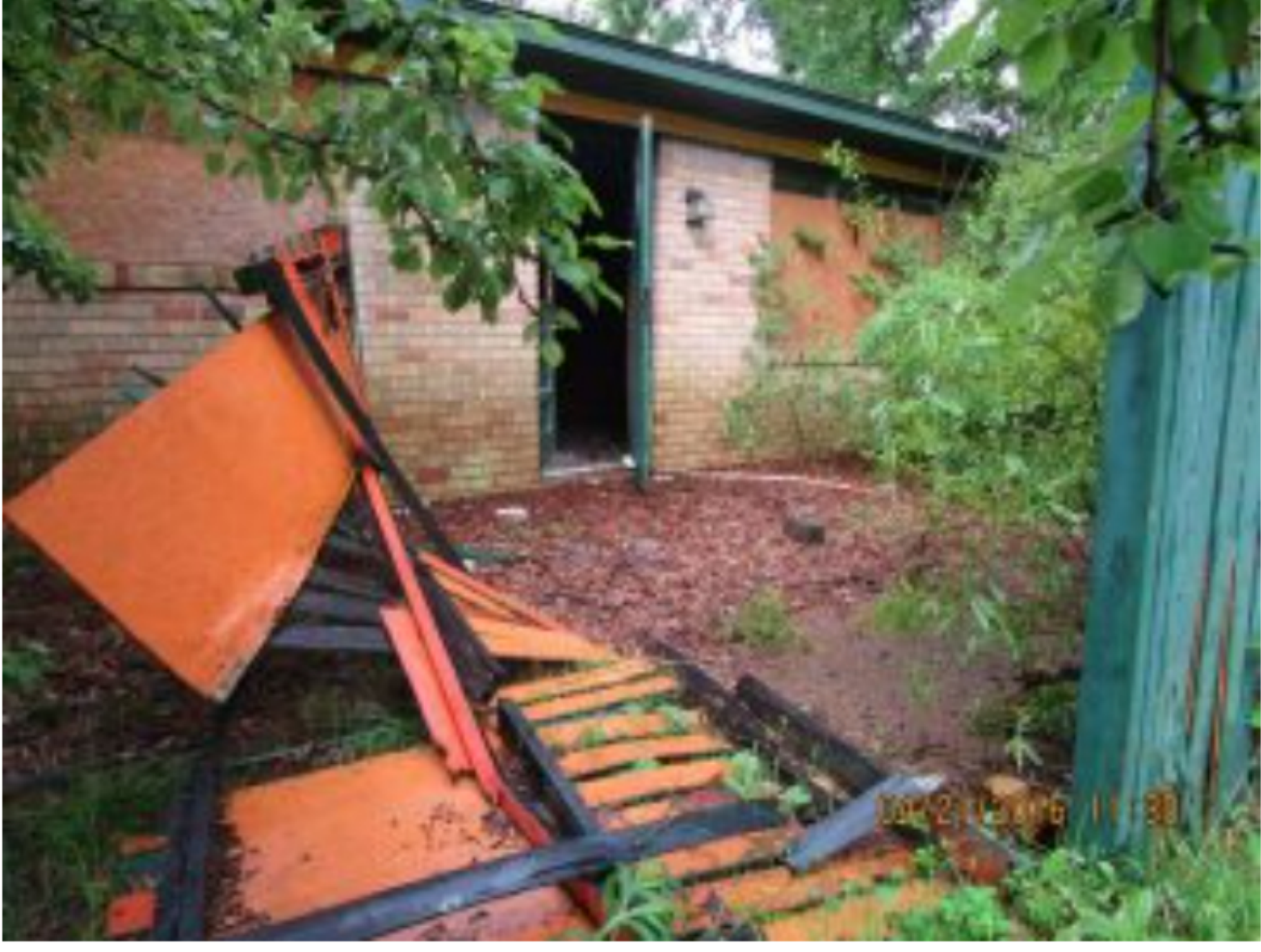
An open door and piles of trash were found at this Deutsche Bank property in a non-White neighborhoods in Memphis.