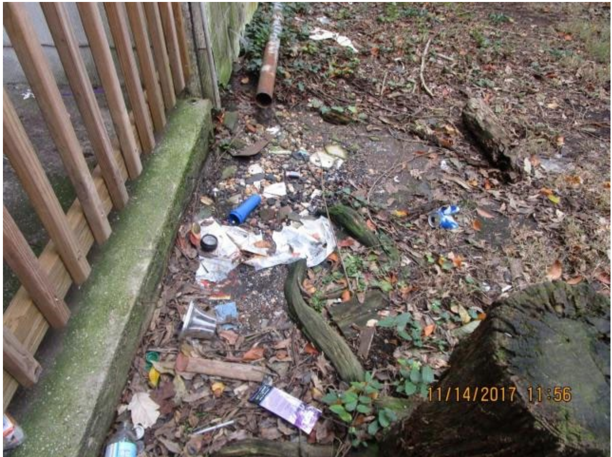
Baltimore MD – Trash and debris