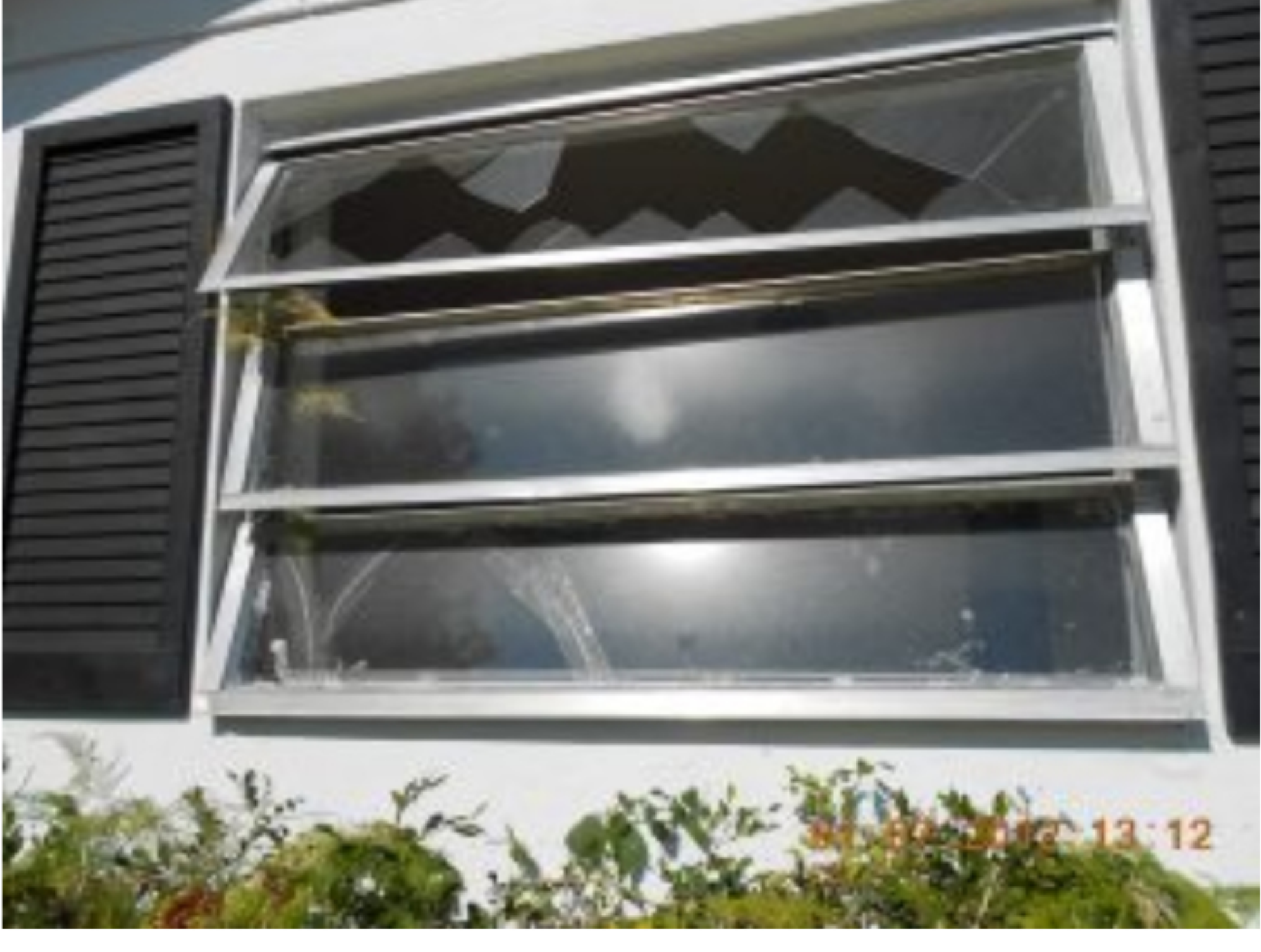
Broken and open windows at a Deutsche Bank Property in a non-white neighborhood of Miami, FL.