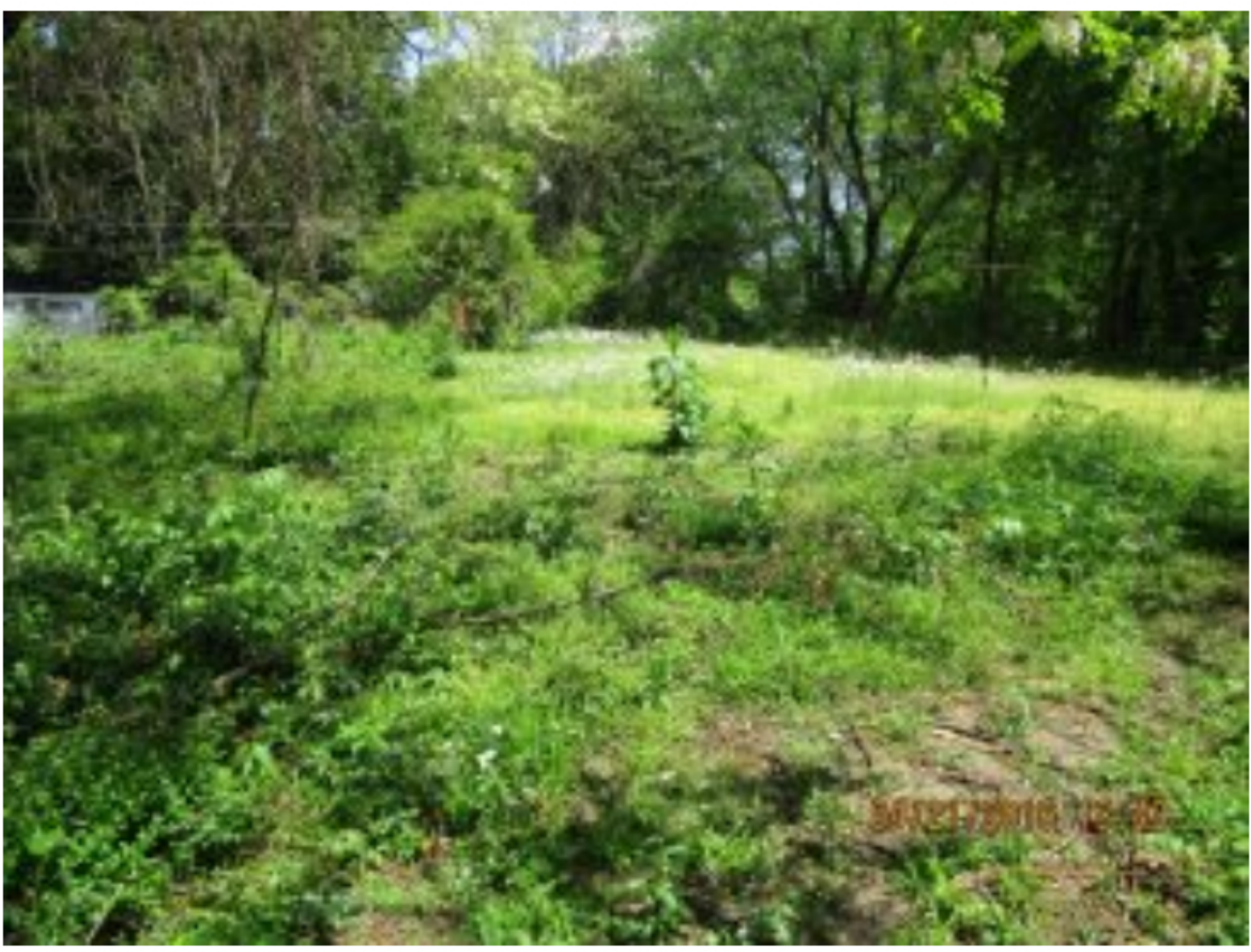
This is the back of a Deutsche Bank property in Memphis, with overgrown, untrimmed grass