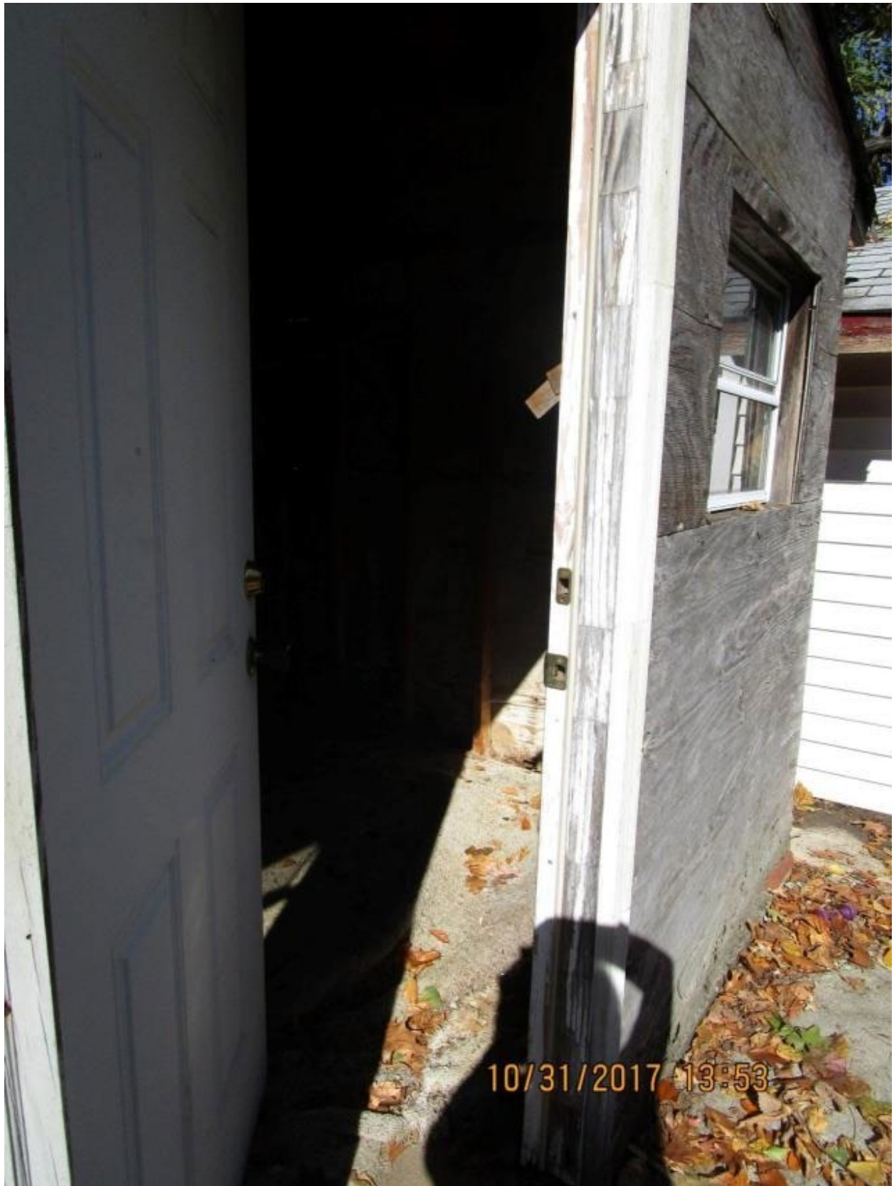
Capitol Heights, MD – Unsecured door