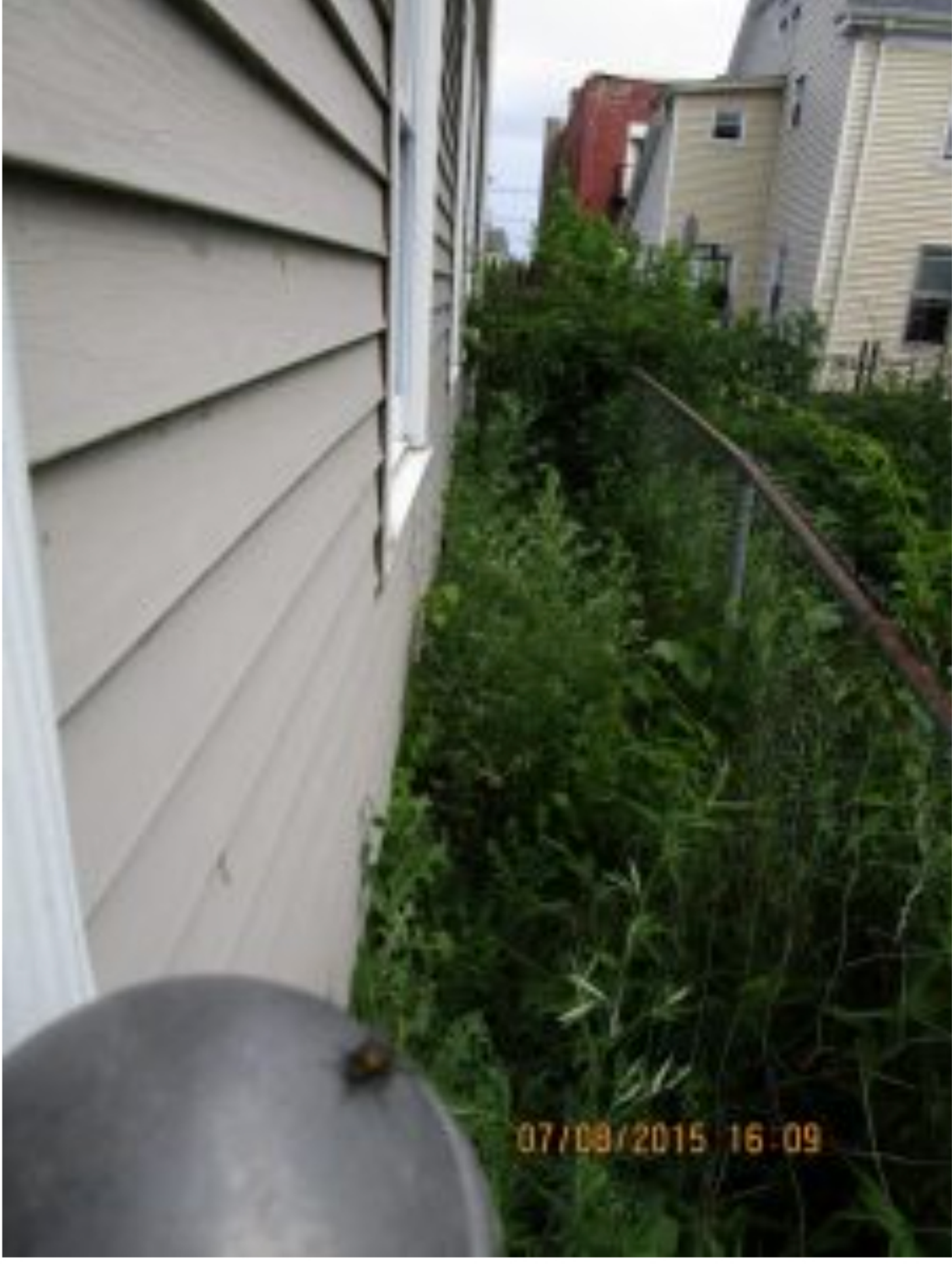
Weeds and untrimmed grass at a property owned by Deutsche Bank in a non-white neighborhood in Providence, RI.