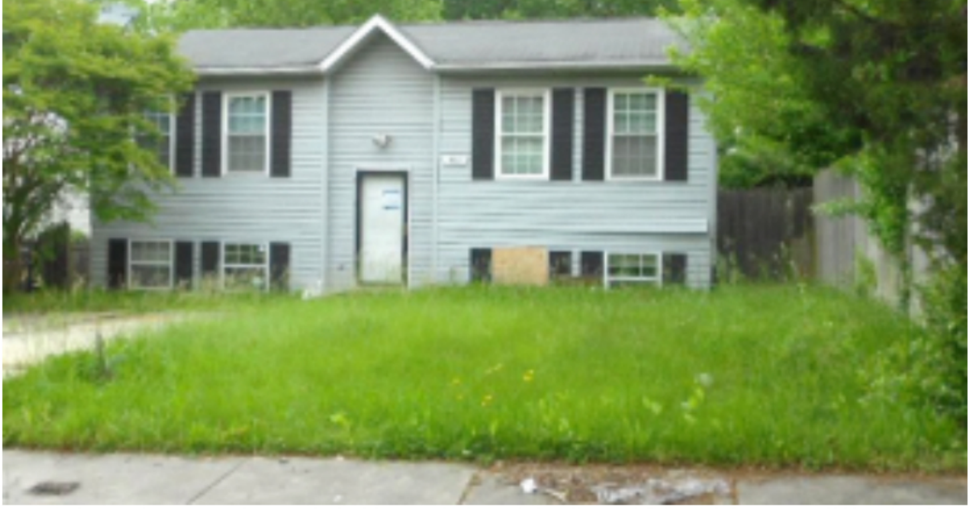
This home in a nice, African American neighborhood in Prince George's County, MD has been completely neglected by Deutsche Bank.