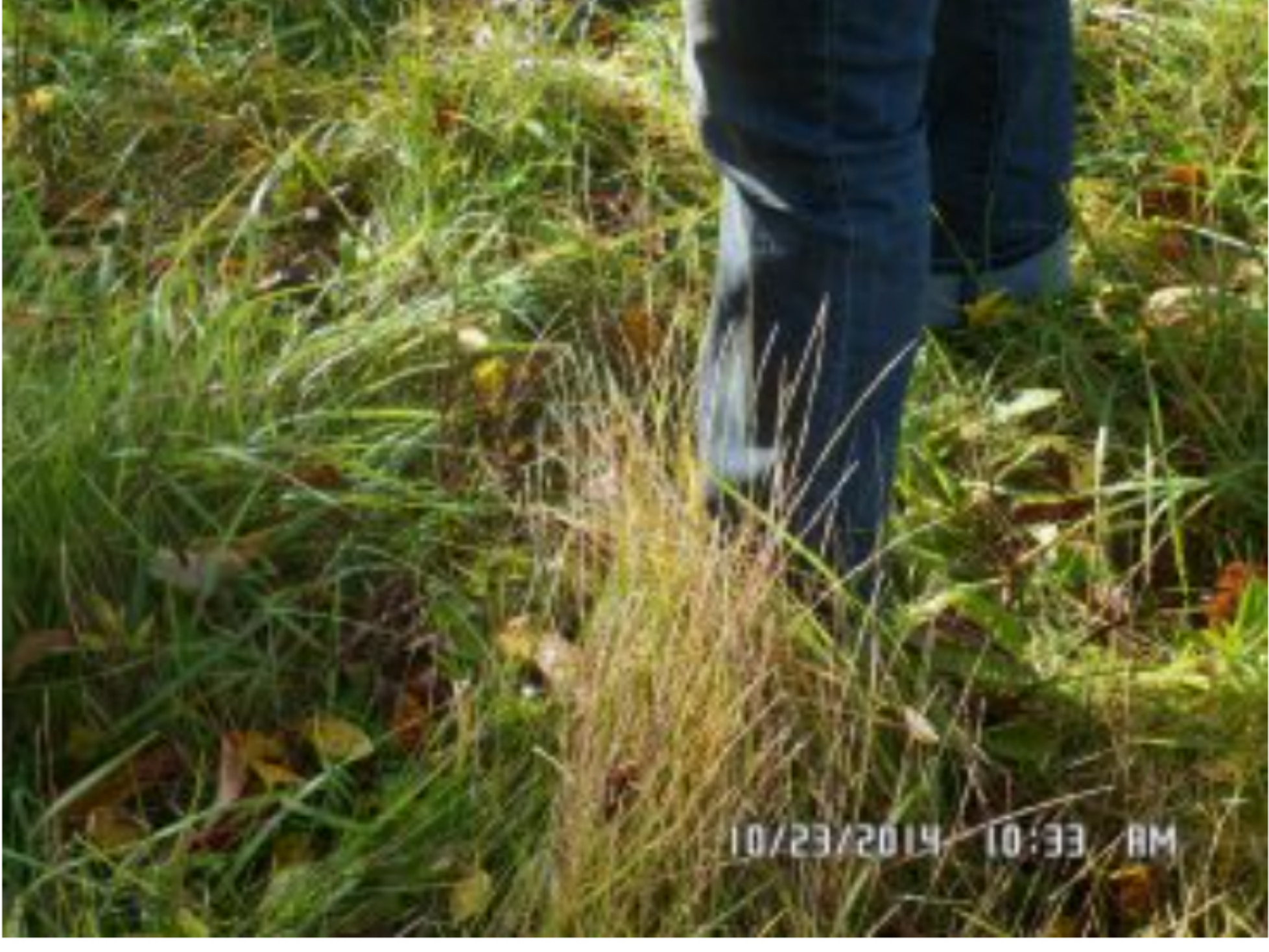
Overgrown grass from a non-white property owned by Deutsche Bank in Indianapolis.