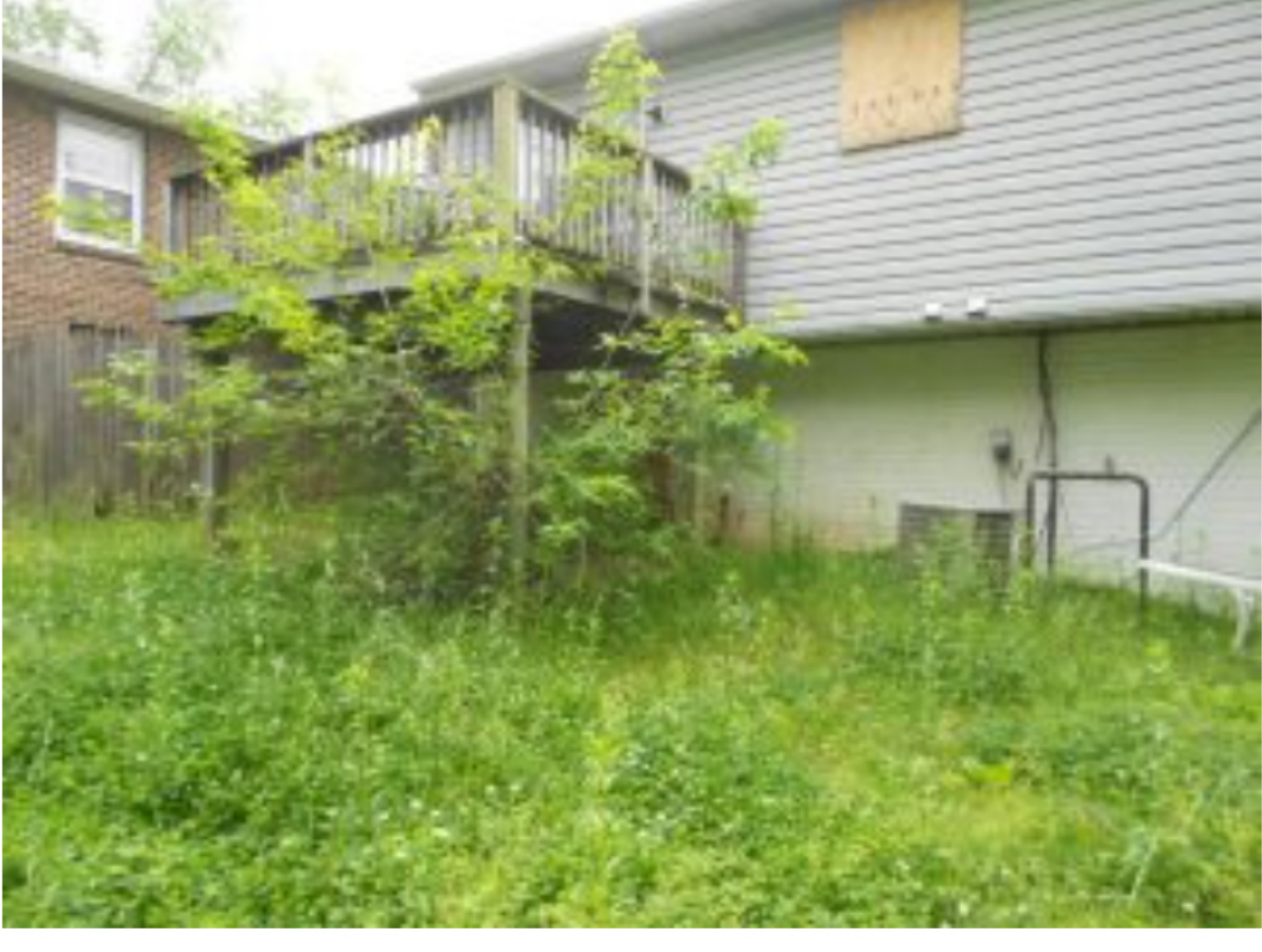
Overgrown grass at a Deutsche Bank-owned house in Capitol Heights, MD (Predominantly African American)