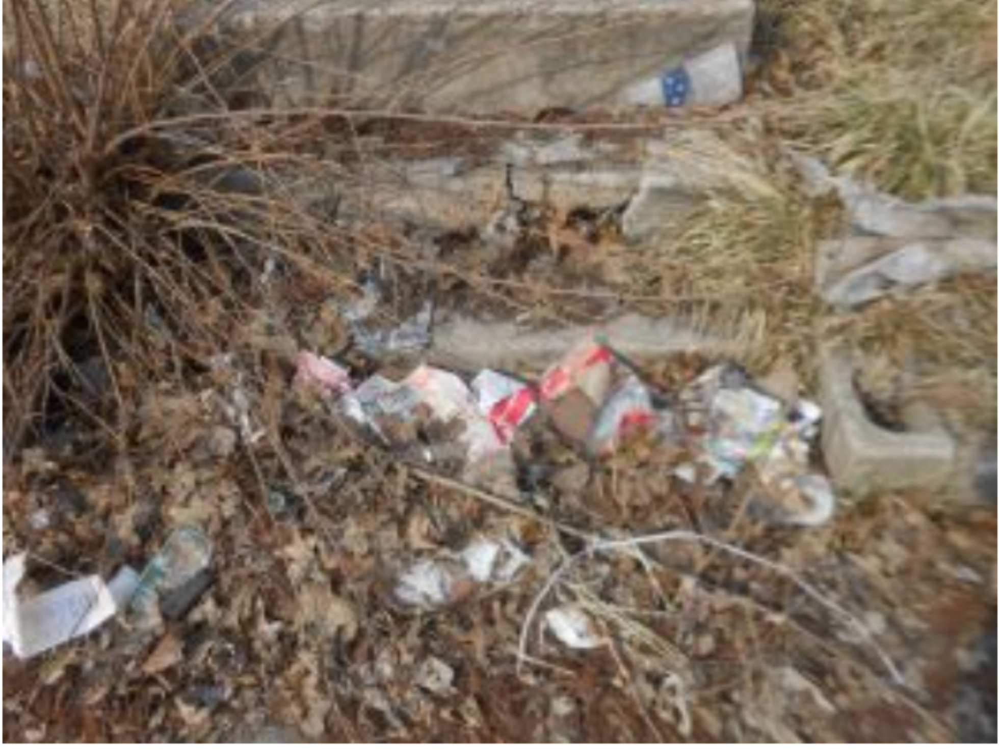
A pile of trash from a Deutsche Bank property in one of Indianapolis' non-white neighborhoods.