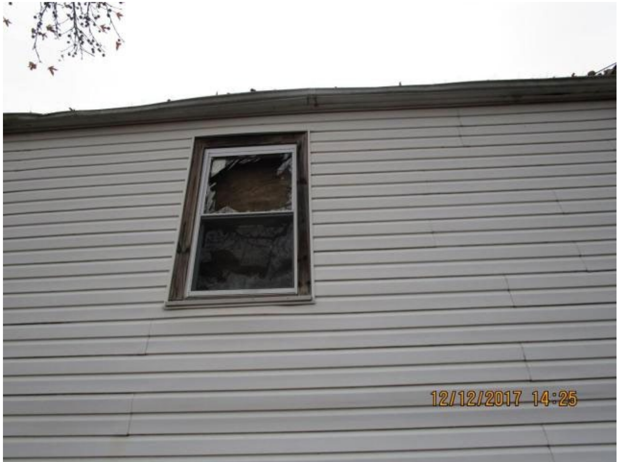
Capitol Heights, MD – Broken window