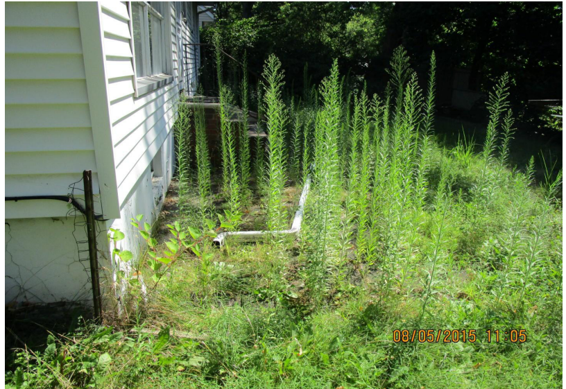
Tall weeds in the neglected backyard of an REO in a predominantly Non-White neighborhood in Roselle, New Jersey

exponentially when the particular local jurisdiction has a high rate of foreclosures. When banks neglect their assets, many of the related expenses become the burden of the local government. 5